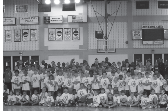
Last Years campers had a terrific time